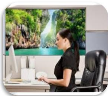
Hospitality & Catering