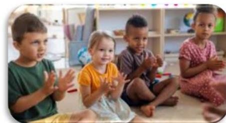
ECD - Early Childhood Development